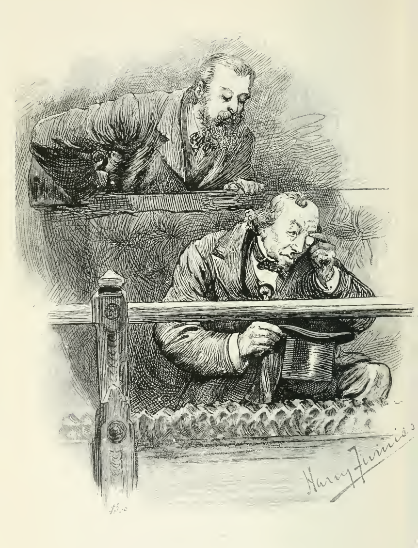
LORD BEACONSFIELD'S LAST VISIT TO THE HOUSE.